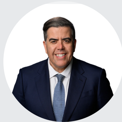
Milton Dick MP Member for Oxley

“The Albanese Government is committed to helping older Australians keep more money in their pockets.”