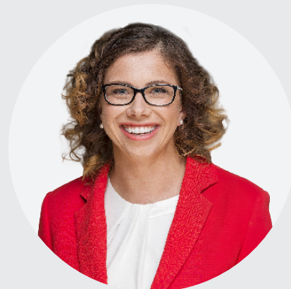
Amanda Rishworth Minister for Social Services