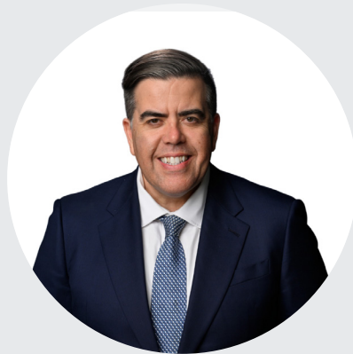
Milton Dick MP Member for Oxley

“The Albanese Government is committed to helping older Australians keep more money in their pockets.”